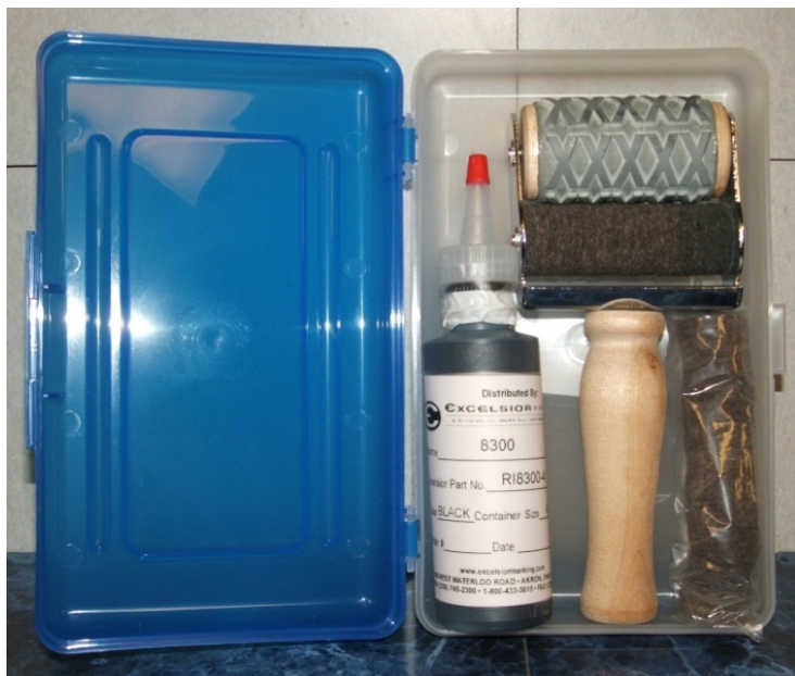
X-OUT STAMP KIT -----$150.00

Combo kit consisting of: Roller with X out die, 4 oz. bottle of C-1526 ink, (12) felt replacement ink rollers, 1 zip lock bag to place roller in, 1 container.