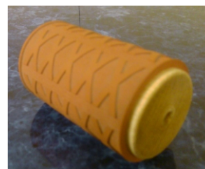
Roller Sleeve only: $85.00

Roller only: Consisting of complete roller with X out die or IPPC